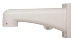
Wall Mount Included