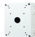
3000/146 Junction box

Technical specifications are subject to changes without notice.