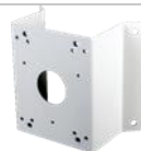
3000/145 Corner adapter